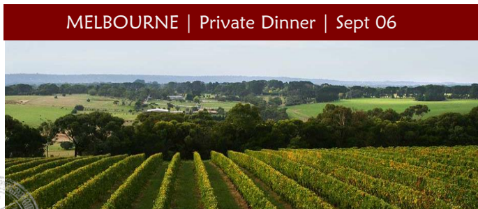
MELBOURNE | Private Dinner | Sept 06