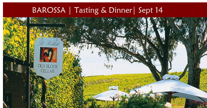
BAROSSA | Tasting & Dinner | Sept 14

Throughout the 70 year odyssey there have been a few unerring constants: an absolute dedication to the Barossa; a love of Shiraz; and a promise to 'do it once, do it right'