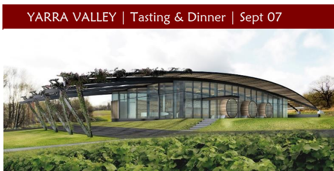
YARRA VALLEY | Tasting & Dinner | Sept 07

Rising from the shores of the Yarra River at 75 meters and peaking at 225 meters above sea level, Levantine Hill vines thrive in looking out over steep clay loam slopes, at similar elevations to the Grand Cru vineyards of Chablis, France.