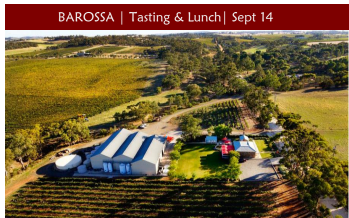
BAROSSA | Tasting & Lunch | Sept 14