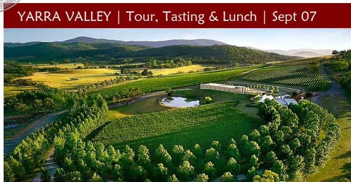
YARRA VALLEY | Tour, Tasting & Lunch | Sept 07

These wines have received global acclaim and established a strong reputation in restaurants and fine wine stores around the world.