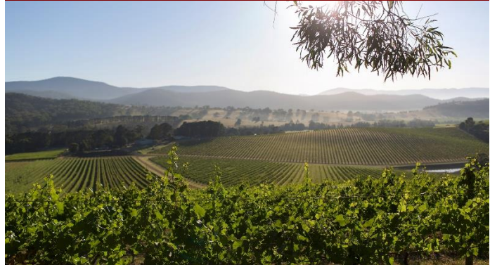
YARRA VALLEY | Tour, Tasting Lunch | Sept 09