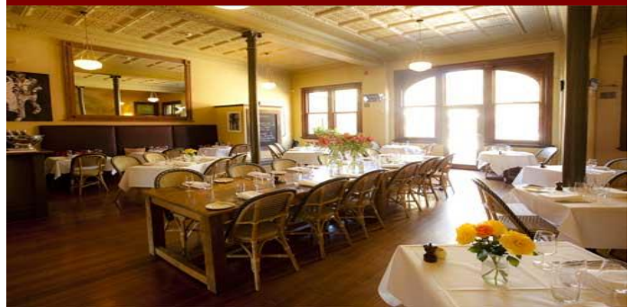
YARRA VALLEY | Healesville Hotel Dinner | Sept 09

Wines will be available from an assortment of highly acclaimed Yarra wine producers.