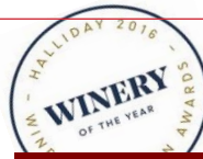
YARRA VALLEY | Tour + Dinner | Sept 08

Also planted are the traditional varieties Cabernet Sauvignon, Merlot, Cabernet Franc, Chardonnay, Riesling, Semillon, Sauvignon Blanc and Verdelho